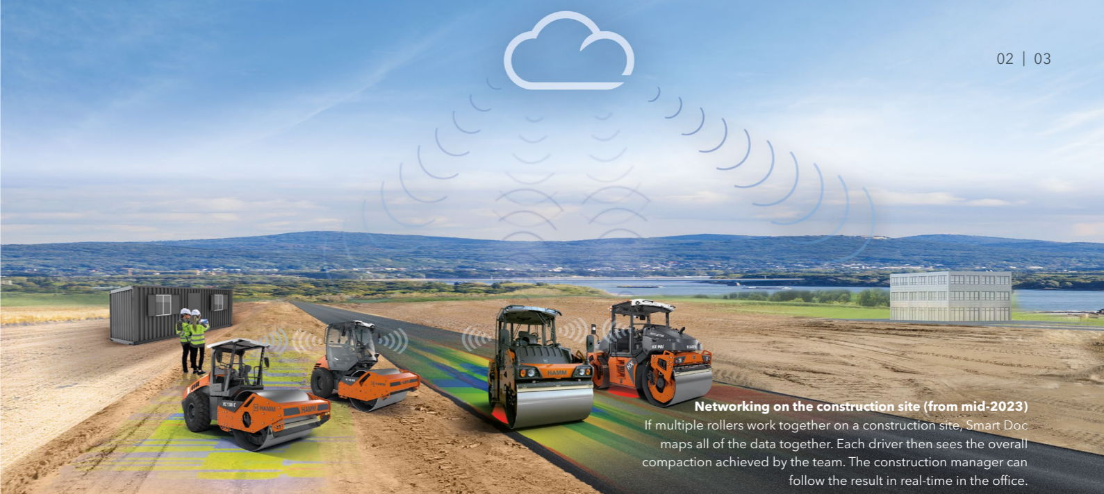
Networking on the construction site (from mid-2023)

The data is available for analysis, continuous compaction control and documentation. Furthermore, Smart Doc can automatically generate test reports as reliable and accurate evidence of basic continuous compaction control and export them as PDF reports.