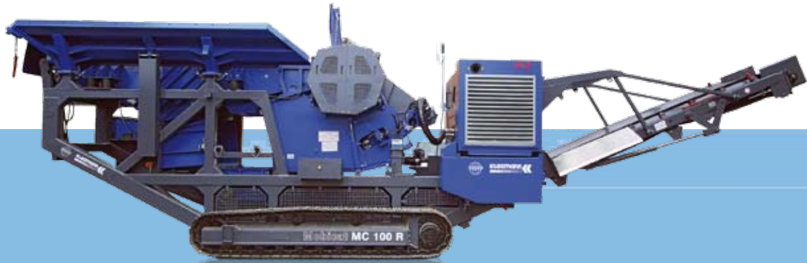
Side view MC 100 R transport position