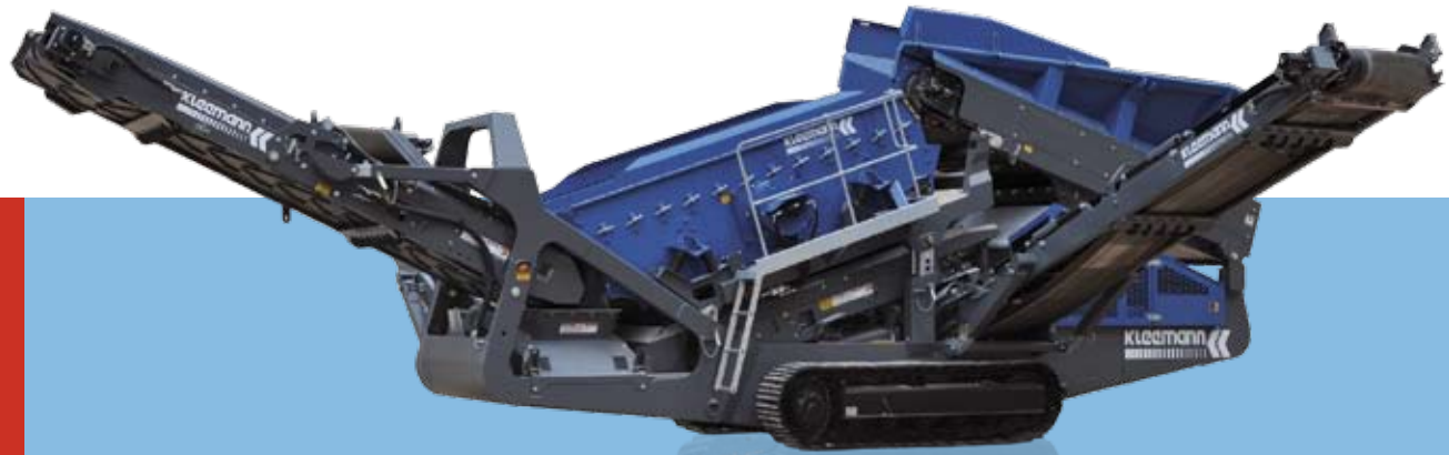
Side view MS 12 Z-AD transport position