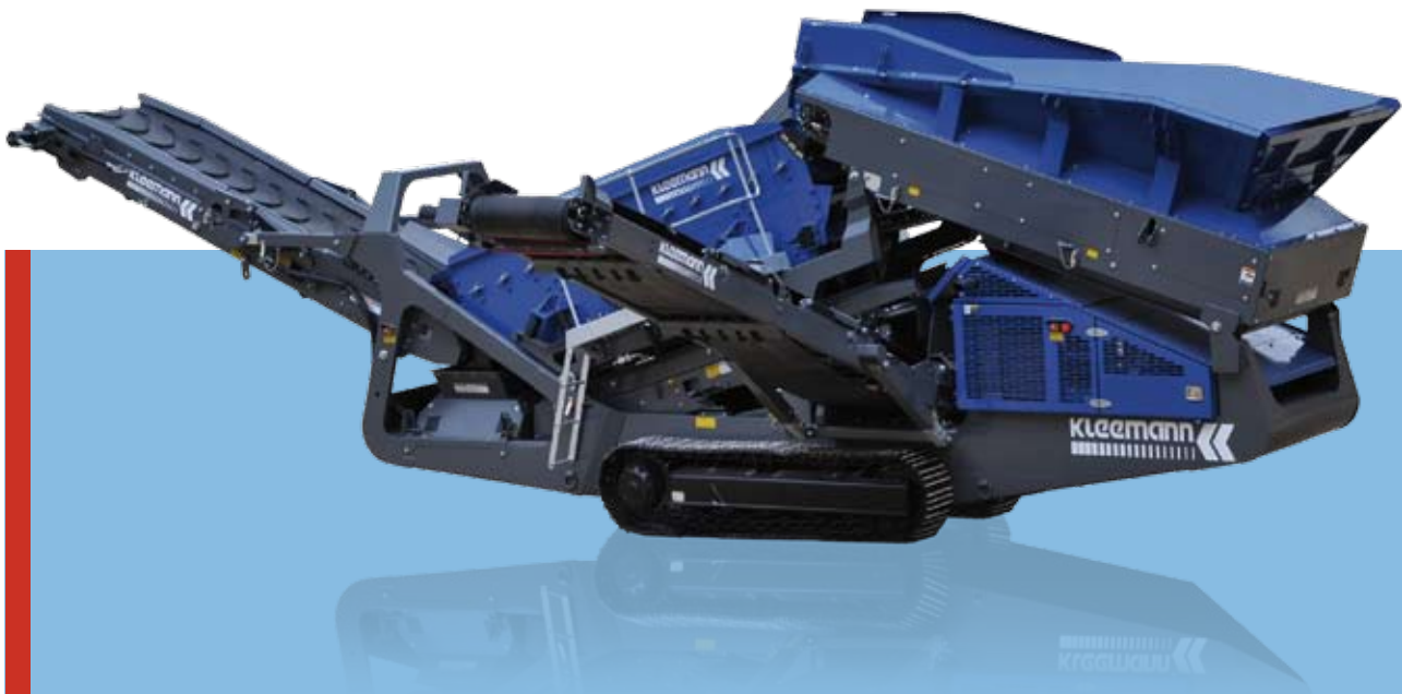
Side view MS 13 Z-AD transport position