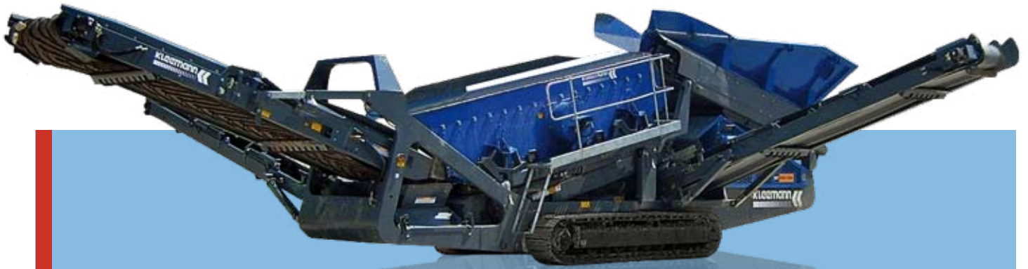
Side view MS 15 Z transport position