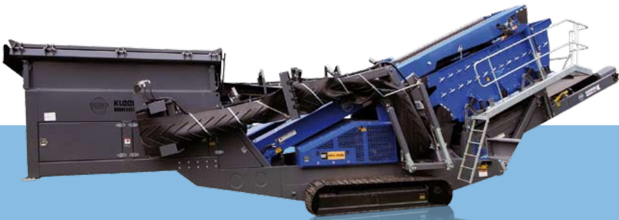
Side view MS 16 D transport position