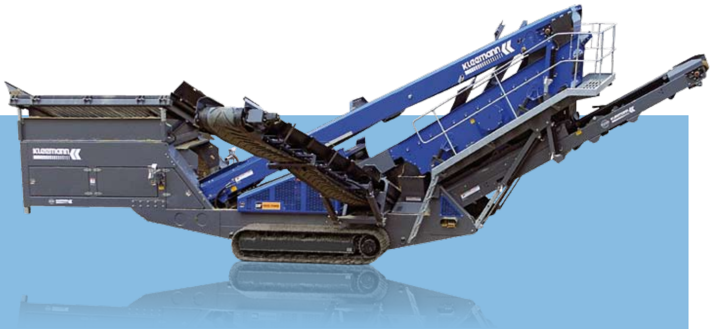
Side view MS 16 Z transport position