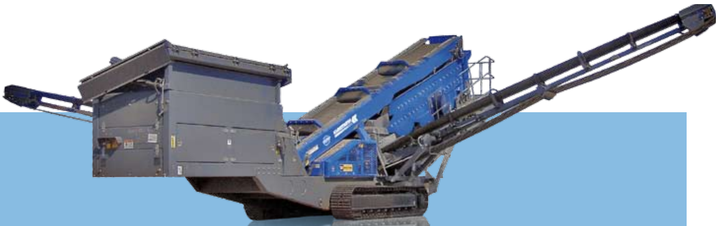
Side view MS 19 D transport position