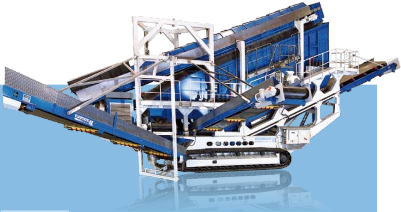
Side view MS 23 D